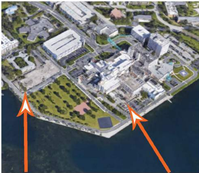
MERCY MEDICAL ARTS

LOCATED ON BEAUTIFUL BISCAYNE BAY ON THE MIAMI MERCY HOSPITAL CAMPUS